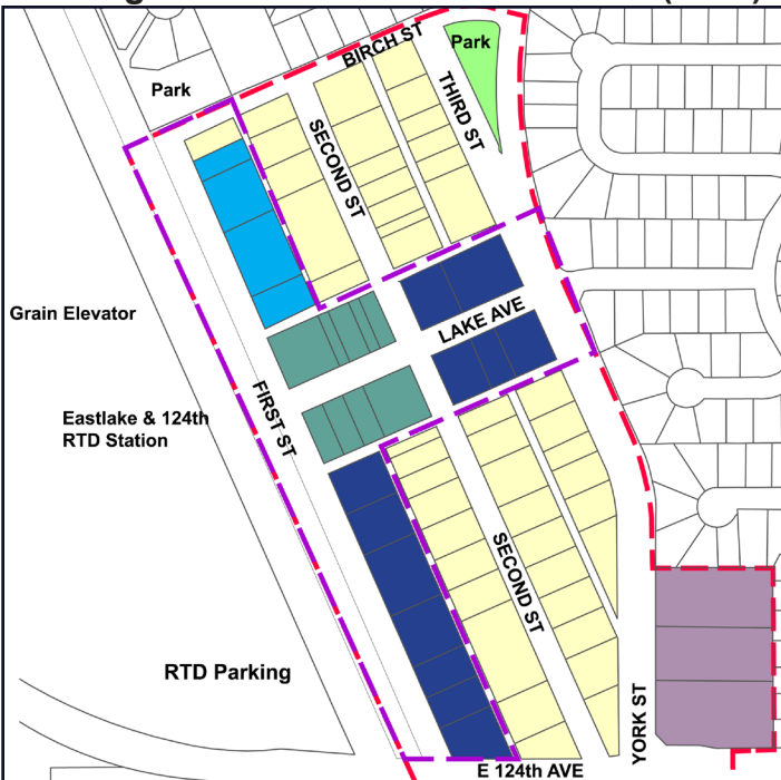
Existing Nonresidential Zone Districts (2003)

Thornton will contact all property owners whose properties are identified on the map below to discuss the potential changes once drafted. If the new zoning is approved by Thornton City Council, the city will subsequently rezone property for any interested property owners. The new zoning would be optional and property owners can choose to retain their existing zoning. The city is only actively pursuing the properties along First Street and Lake Avenue, displayed as Eastlake Mixed Use in the "Proposed Zone Districts" map. Recently developed properties in the Neighborhood Services Zone District are not proposed for the rezoning.