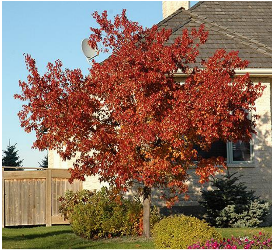
Tatarian Maple “Hot Wings” Acer tataricum