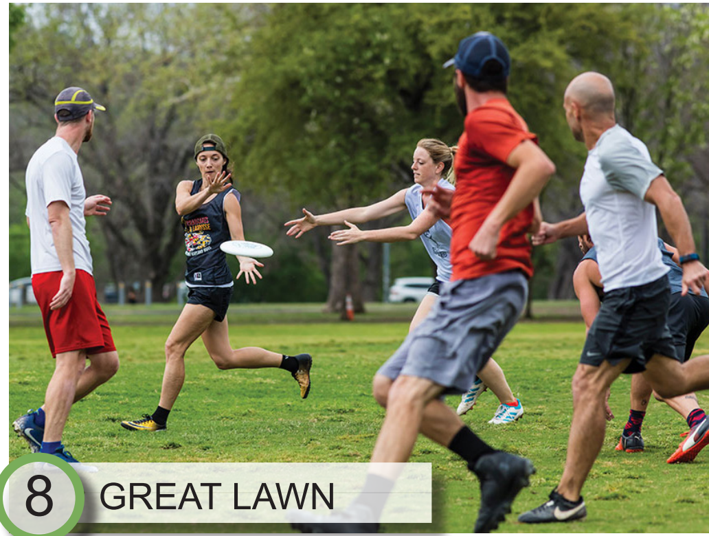
8 GREAT LAWN