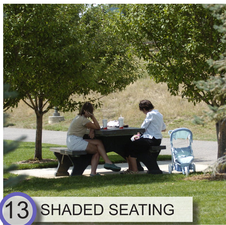
13 SHADED SEATING