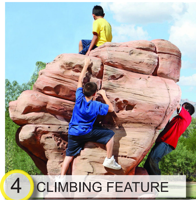
4 CLIMBING FEATURE