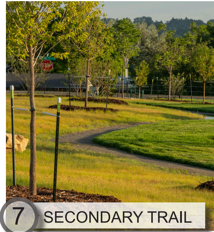
7 SECONDARY TRAIL