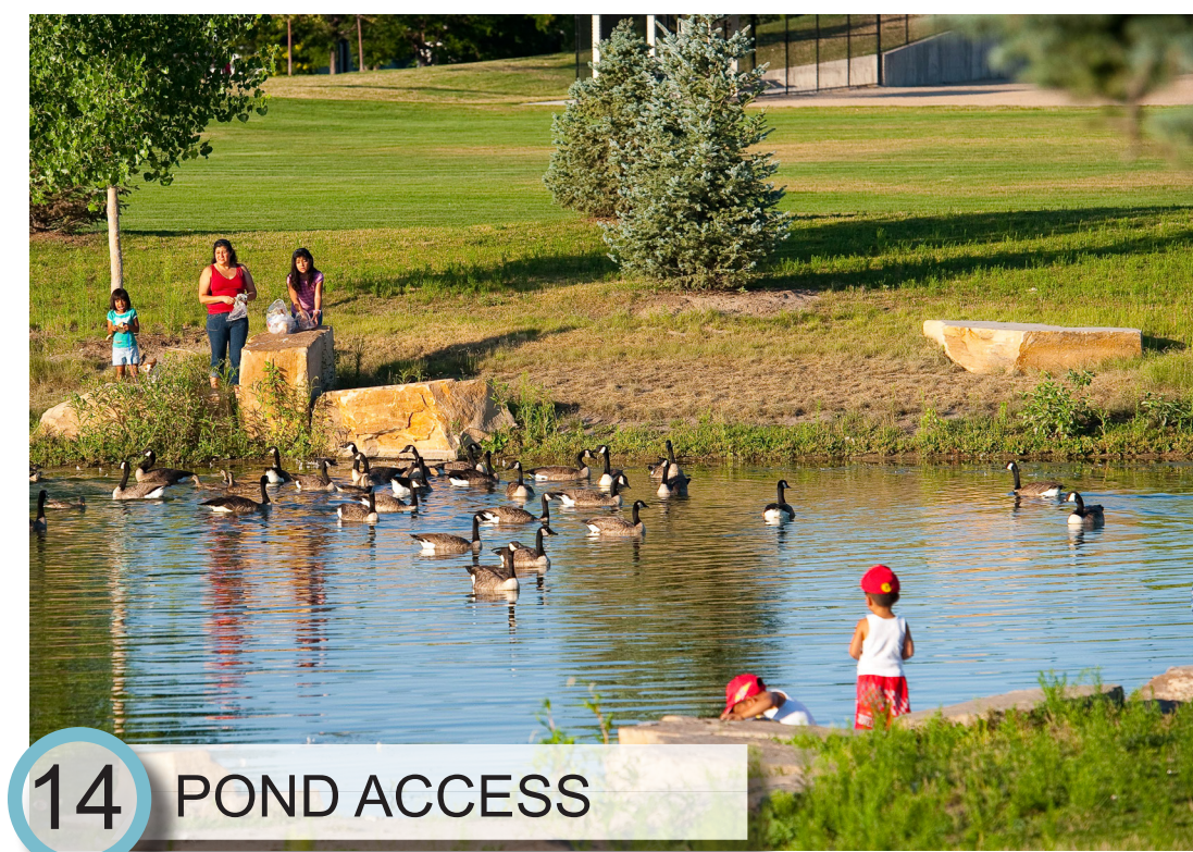
14 POND ACCESS