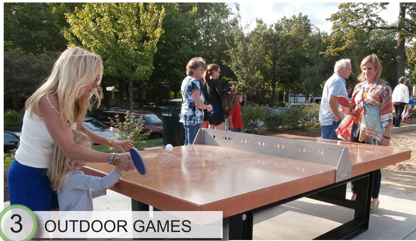
3 OUTDOOR GAMES