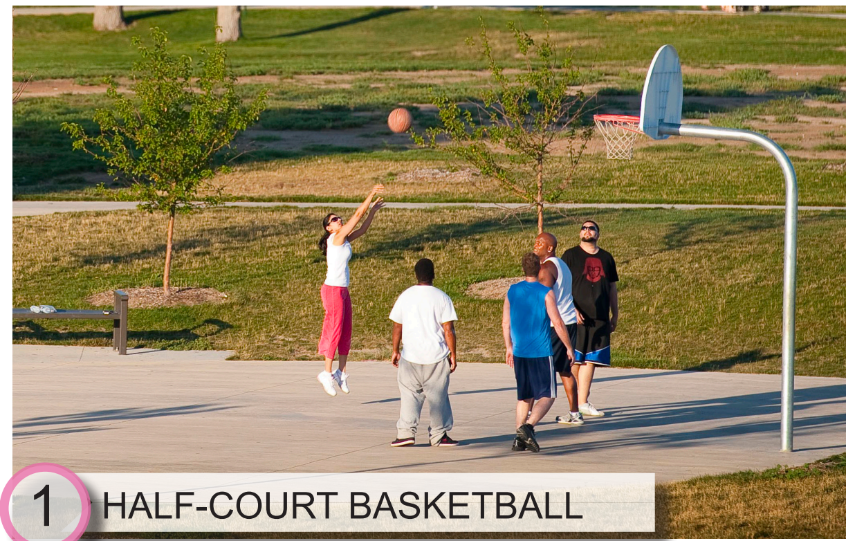
1 HALF-COURT BASKETBALL