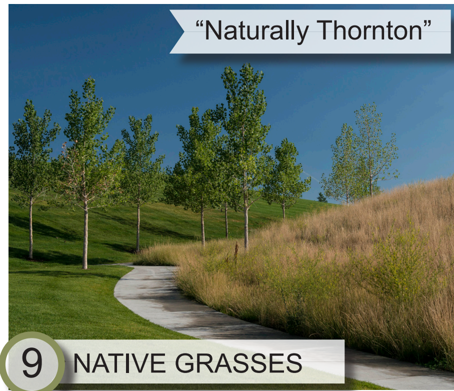
9 NATIVE GRASSES