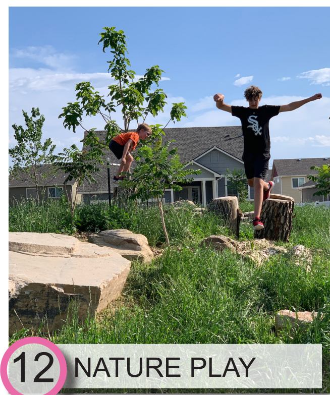
12 NATURE PLAY