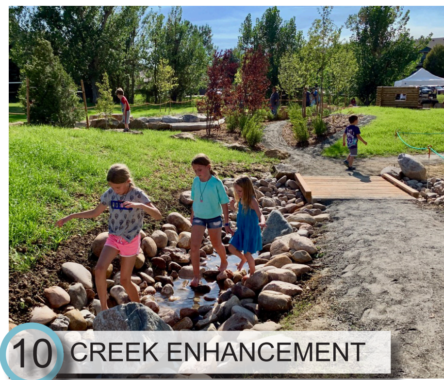
10 CREEK ENHANCEMENT